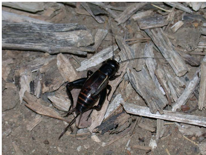
Variable field cricket Gryllus lineaticeps

brought to an indoor space away from flies and housed in individual plastic containers with shelter, substrate, water, and food. The containers were checked daily for the presence of parasitoid pupae to determine parasitism status.