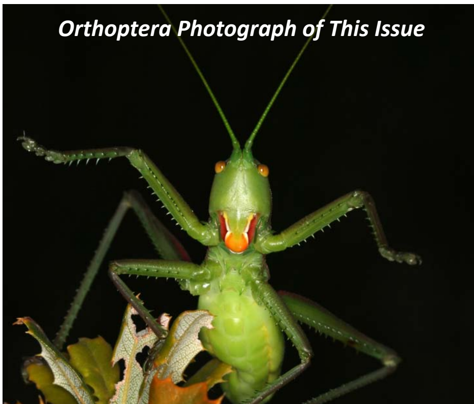
Hemisaga denticulata (White) (Tettigoniidae: Austrasaginae). Cape LeGrand National Park, Western Australia, Australia.