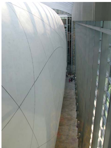
Figure 1. View of the Darwin Centre 2 Cocoon which contains the store rooms which house the entomological and botanical collections.

& 2). The majority of the collection consists of dry pinned specimens, but most of the termites and a small proportion of the other groups are stored in alcohol (70% industrial methylated spirit). The pinned specimens are housed in 4,639 drawers, of which 3,940 hold the main identified series and 699 contain unidentified or partly identified specimens.