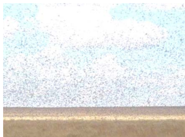
Swarm of Locusta migratoria capito in Madagascar

On a more positive note, a Red List Assessment of southern African Orthoptera is in the initial phases of planning as one of the objectives of the IUCN's new Grasshopper Specialist Group (GSG). The assessment is getting off to a slow start but aims to finalize a list of contributors and participants and an action plan within the next few months. Southern African Orthoptera have recently been the focus of renewed interest, but the region is still home to many poorly-understood species with unresolved taxonomy. The as-