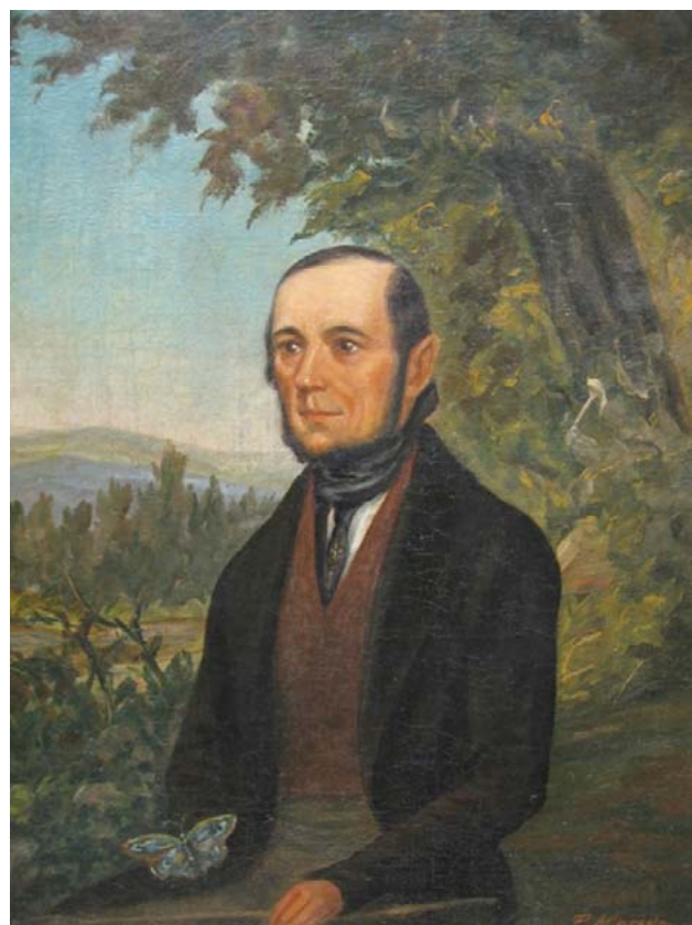
Figure 1. The posthumous (circa 1930) portrait of Franz Gustav Straube painted by Brazilian artist Pedro Macedo

Some of rare and brief biographical comments from the entomological literature are: " Straube, Gustav, früher in Dresden, nach Brasilien