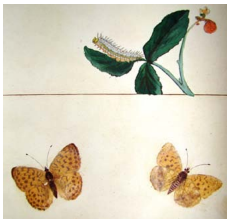
Figure 2. Examples of the Straube's Catalogue of Butterflies from Europe: a selected page (the genus Daphne ) and detail of the same plate, showing the specimens in dorsal (bottom left) and ventral (bottom right) view.

1846a,b) may have been destroyed. This technique is known as "nature printing" and the person attributed with the invention of the process, called Naturselbstdruck in German, is the Austrian naturalist Alois Auer in 1853 (Auer, 1854), therefore several decades before Straube's initiative.