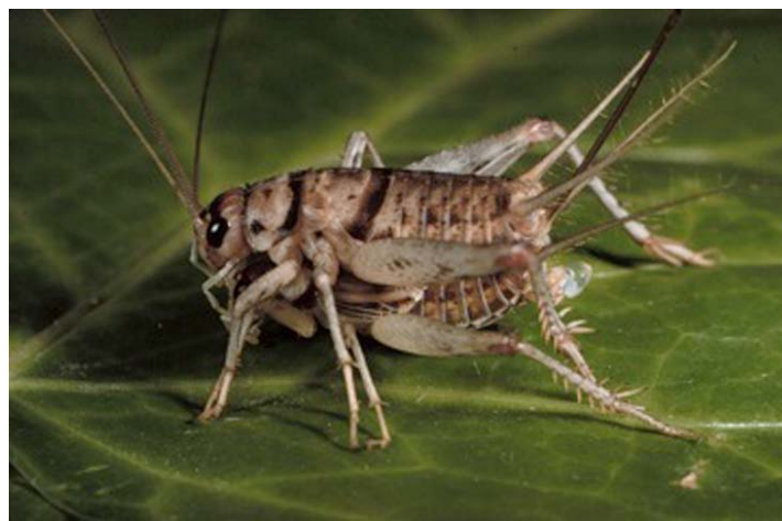
Figure1. Female (above) and male (below) decorated crickets in copula.

Additional evidence for CHCs as the underlying proximate cues facilitating chemosensory self-referencing comes from a recent behavioral assay involving direct, external application of female-derived CHC extracts to the epicuticle of males. In mate choice trials, focal females mated significantly more often