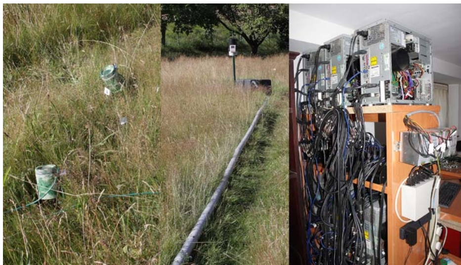
From left to right: Cameras on meadow, weather station and cabling pipe sending the video stream to the computers, recording computers.

Every year, by the end of the winter, late instar nymphs complete diapause and re-open their burrows to resume growth. At 2-3 days intervals, we search for newly opened burrows across the meadow and mark them with numbered flags. By the end of April all burrows are marked and the adults have started