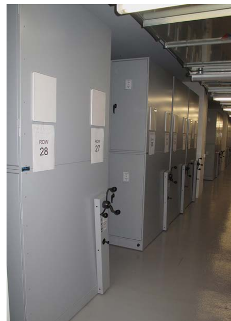
Figure 2. The 7 th floor store room in Darwin Centre 2 in which the orthopteroid collection is now housed.

It is also worth noting that the NHM's orthopteroid collection, plus most of the NHM's other pinned insect collections and many of its botanical specimens, are now housed in a state-of-the-art building called Darwin Centre 2 (see http://www.nhm.ac.uk/visit-us/darwin-centre-