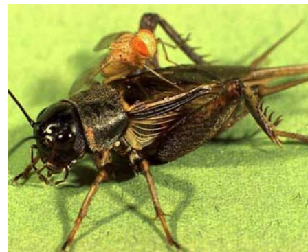
Osmia fly on Gryllus sp.

location and time period indicates that females are not able to directly detect the presence/absence of flies and change their behavior accordingly. However, because of the significant population effect, there is some indication that other things that change because of the flies (density of males) or that cues to fly activity (environmental factors) may affect female responsiveness to male song. An experiment examining the effect of chorus density on female responsiveness to male song was conducted in the laboratory in spring 2009 to determine if the number of males calling could be a possible explanation for the patterns in this field experiment.