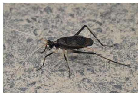
Meloidomorpha japonica .

migratoria , distributed worldwide may be divided into 2 major groups based on a molecular study.