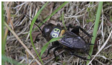
Tagged male (Photo credit: www.wildcrickets.org).

to emerge. This is the time when we collect them. Shortly after emergence, every individual is trapped, measured, weighed, labelled with a unique 1 or 2 character code and sampled for a small portion of their right hind leg, before being released in their source burrow. We use that leg tissue to extract DNA that Amanda Bretman (now at the University of East Anglia) amplifies for 14 microsatellite loci. This genetic screening allows us to build a pedigree, so that we can assign parents and offspring to each individual. By the time we collect the adults, we have already placed 96 cameras over a random sample of the burrows across the meadow, and the system